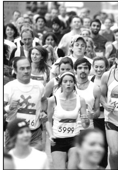
Hank Azaria and Simon Pegg star in Fat Boy, Run .